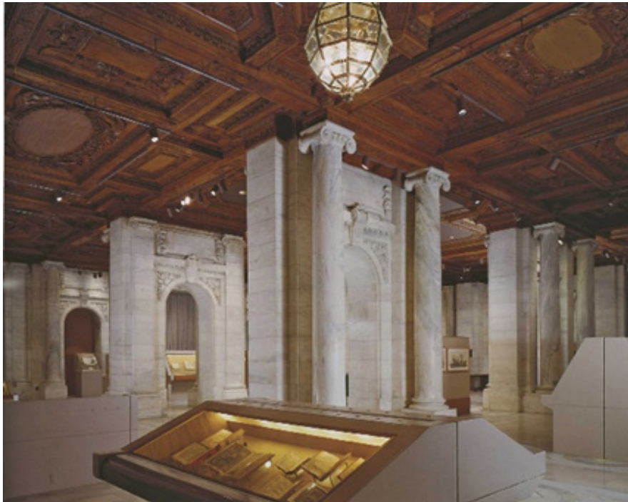
Fig. 1 Note that the wood ceiling of Gottesman Exhibition Hall was cut in hundreds of places to accommodate track lighting and new holes cut for new pendant fixtures in new locations altering the spatial organization of the room and damaging one of its principal decorative features.