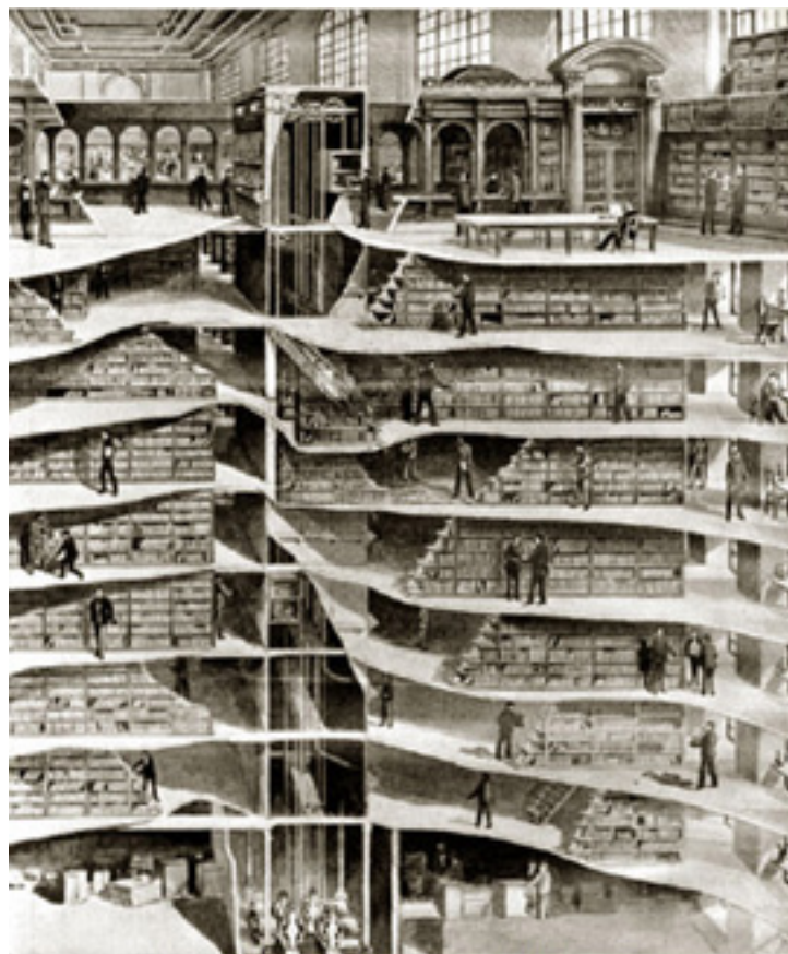
Fig. 6 Seven floors of steel bookshelves provide structural support for the reading room above.