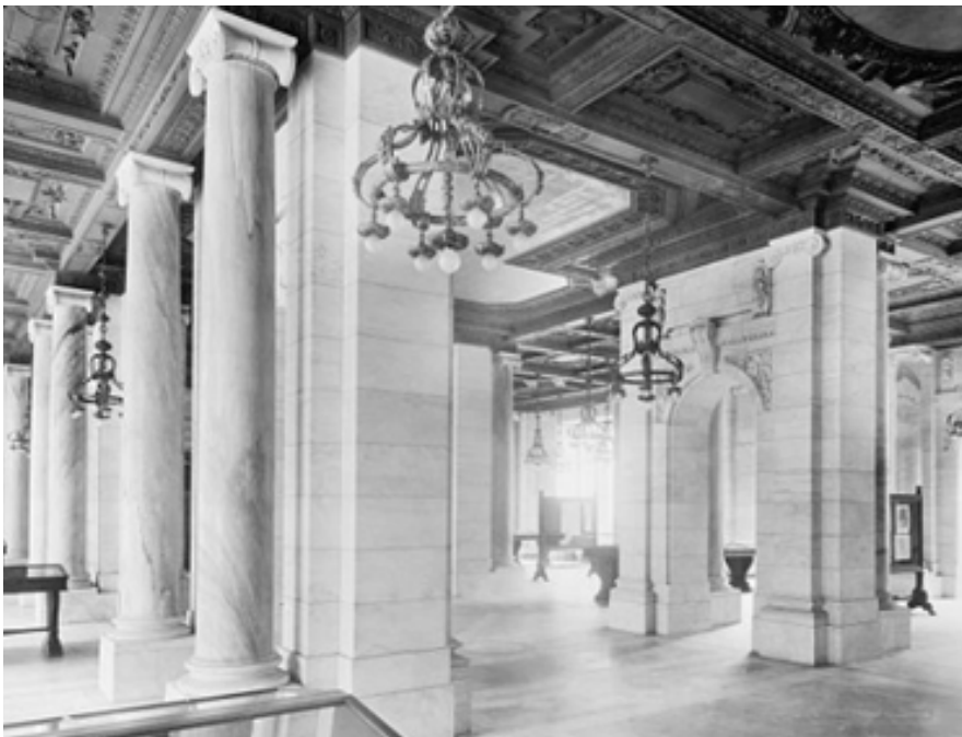
Fig. 2 The original light fixtures, designed by Carrère & Hastings are lost.