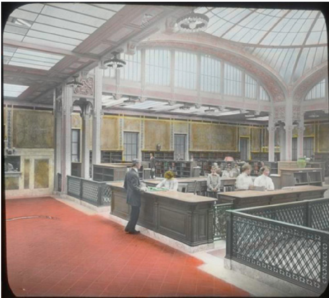
Fig. 3 Circulating Library, New York Public Library with perimeter skylights and original Carrère & Hastings light fixtures.