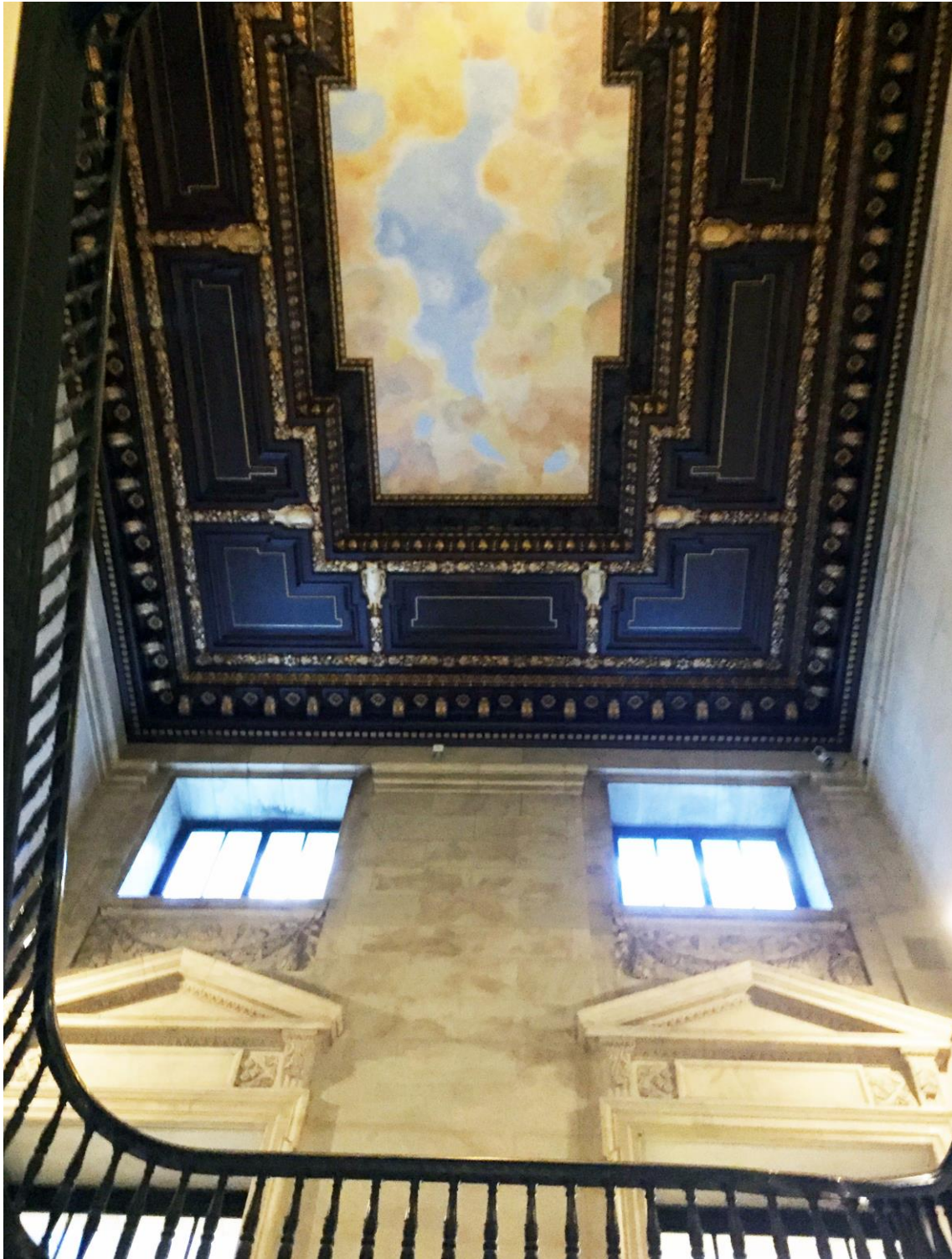
Fig. 1. The 42 nd Street Library's South Staircase. Currently closed to the public, the stairs access every floor and feature a small version of the Rose Reading Room sky mural.